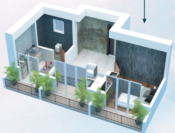
Artistic View 1BHK 285 sq.ft (R.C.A)