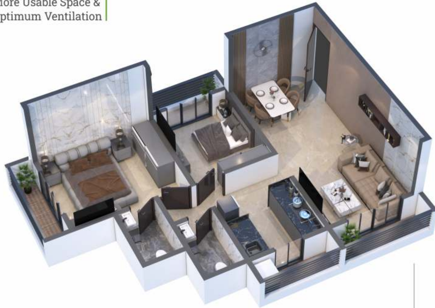
Artistic View 2BHK