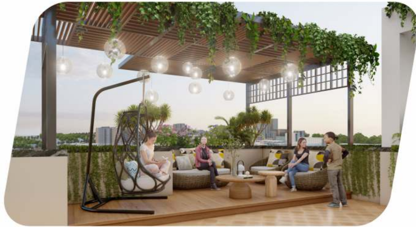
KOOL HANGOUT SPACE - GAZEBO

Discover a terrace garden that encompasses a galore of recreation amenities.