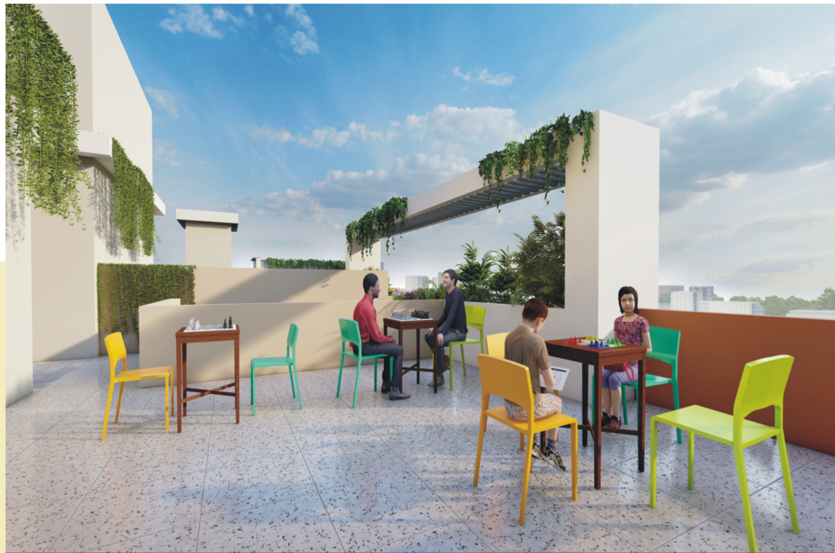
Board Games Zone