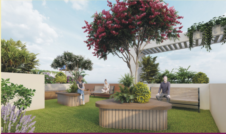
Chit Chat Corner