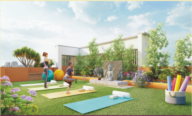
Yoga & Meditation Zone