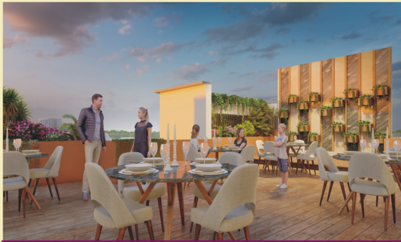
Party / Community Zone