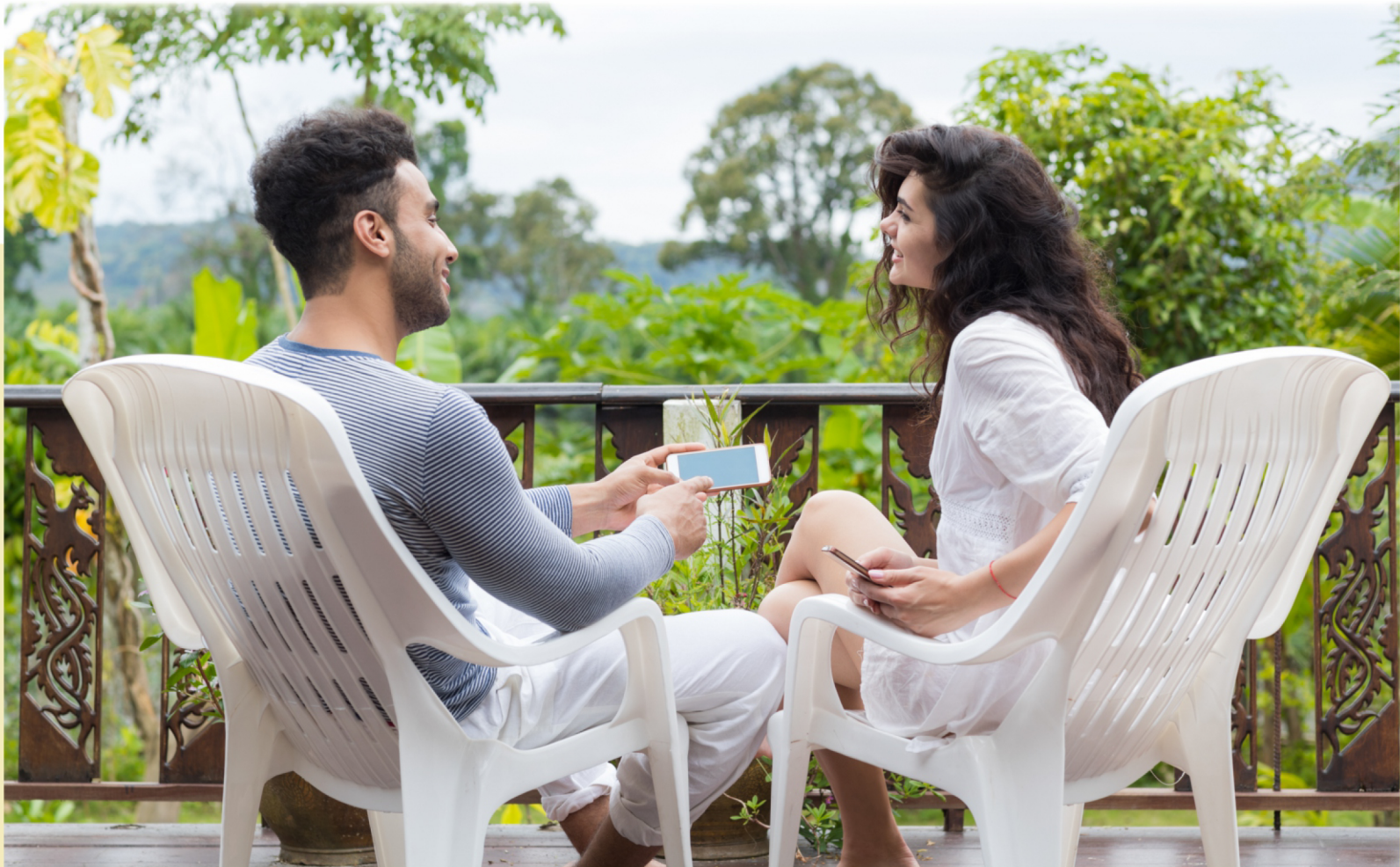
Sit | Relax | Chit Chat at Sitout Balconies

Enjoy the Views & the Serenity of Nature