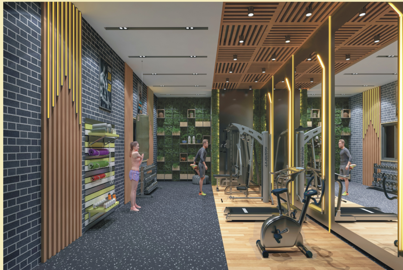
Indoor Well Equipped Gymnasium